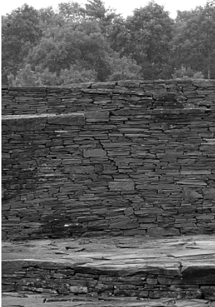
Fig.5. Clearly visible separation of a diagonal joint at Opus 40

It could also be a little 'chicken and egg', it is possible that the lintel has cracked leading to an opening of the joints above, the diagonal might just be in the mind's eye – I can't make up my mind if there is another running off to the right a little way up, effectively intersecting the first and exacerbating the situation. Perhaps we see what we want to see. However I am fairly certain that the lintel itself is a replacement and not original to the structure. Which I would like to think suggests there is indeed a problem which has had a rather ineffective sticky plaster added rather than applying a cure.