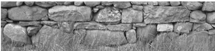
Fig.1. Although built in Nant ffrancon this wall built from reclaimed house stone, (some tracing but every third stone on the second large layer is a through) gives an idea of the Deeside style

These walls contain a lot of large stones, practicalities (and sometimes simply style) might preclude strict coursing. After a less than entirely regular layer of large stones you still have a lot of large stones to use up. This can present difficulties in getting them to sit without creating joints. Rather than employing lots of plates/shims the next layer is (usually) built reasonably thick (the occasional thinner stone will be employed), 'to a course' evening out the irregularities and providing a good level base on which to set the rest (or another layer) of larger stones.