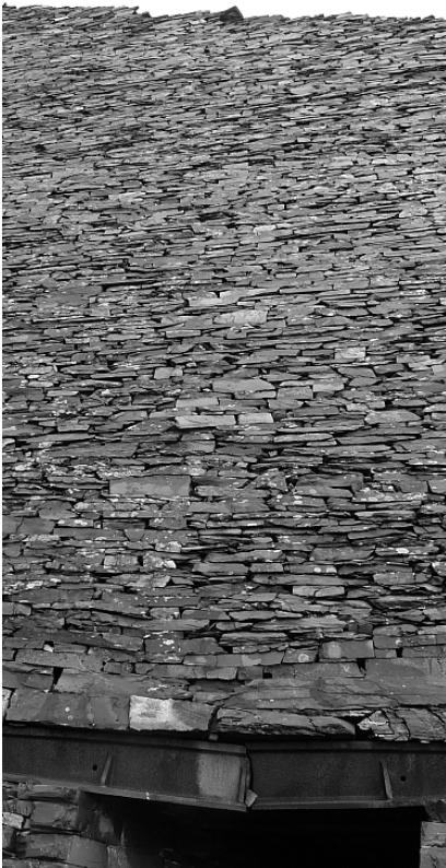
Fig.4a. Cracked cast iron lintel in C4 Incline, Dinorwic Quarry. The result of running joints, or is a vivid imagination at play?

Stone is incredibly strong under compression. We do not have to worry about the stones in a wall being crushed by the stones above them. Gordon in "Structures : or Why things don't fall down" explains that a vertical pile of stone would need to be over 2km high before it was crushed under its own weight, and that tapering (as in a wall) means we could build taller still... "... this is more or less how mountains work. Mount Everest is... about 8 kilometres high and shows no sign of collapsing" . 3 To paraphrase Gordon if you could build a wall high enough you'd have more problem with lack of oxygen than crushing of the foundation stones. Stone in tension is another matter.