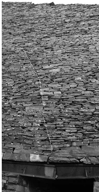
Fig.4b. Highlighted Running Joint?

Whilst most wallers recognise that they shouldn't create joints I wonder if