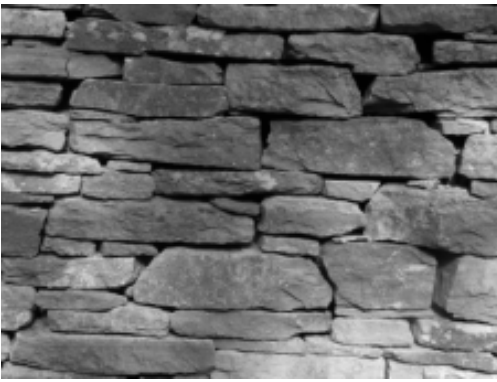
Fig.2. Joints broken by relatively thin stone

alternatives for pressure points can arise. Basically an unsupported stone has the potential to crack. Simply crossing a joint will almost inevitably mean part of the stone is unsupported, it's the way it is and need not, indeed rarely should be, a problem.