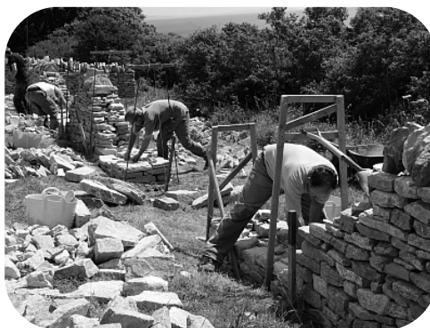
intermediate test in Purbeck, walls battered at 1:12 and built of relatively flat/regular stone

With thousands of miles of wall in the UK, you would not expect uniformity. Practicalities enter the equation; for example you need to be wide enough to fit whatever big stone you have in the footing, and theoretically then get down to a suitable width for the available coping. With smaller and thinner/flatter stone this is usually not a problem, so you can get a reasonable amount of batter on these walls. Big boulders require a wider wall, blockier stone (Aberdeenshire for example) might not lend itself to much of a batter and you can end up with more vertical walls. Larger stone with good length into the wall might require a more vertical wall if they are to fit higher up, without the footing becoming ridiculously wide. You might actually require a batter of more than 1:6 to get from a wide footing to a narrow top.